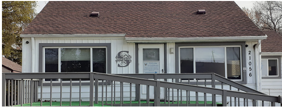
Safehaus Original 586-275-4200 • 21056 DEAN STREET WARREN, MI 48091