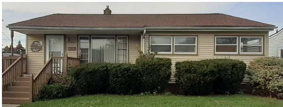
Safehaus Three 586-275-4200 • 21031 DEAN STREET WARREN, MI 48091