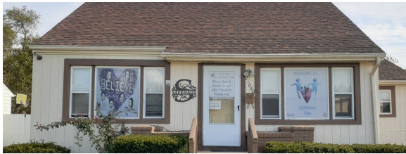
Safehaus Too 586-275-4231 • 21010 DEAN STREET WARREN, MI 48091